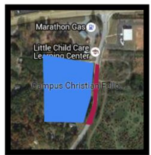
79 & 85 Tyus-Carrollton Rd.