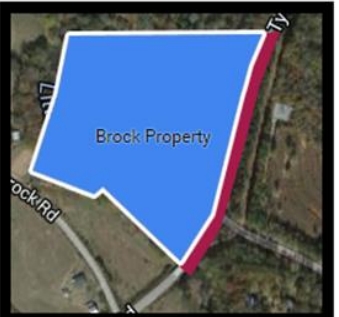
2715 Tyus-Carrollton Rd.