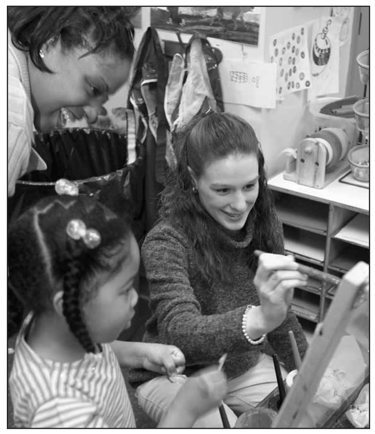
Many of Georgia's finest teachers, principals, counselors, media and technology specialists, speech-language pathologists, and superintendents claim UWG as their alma mater. The University is one of the nation's largest producers of beginning and graduate level educators.

These commitments culminate in educational experiences that foster the development of leaders and productive citizens who make positive impacts throughout an increasingly global society.