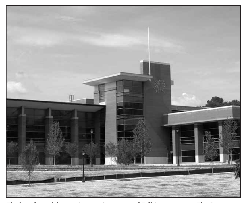
The first phase of the new Campus Center opened Fall Semester 2006. The Campus Center offers a 48-foot climbing wall, fitness facilities, aerobics rooms, 1/8 mile track, basketball courts, TV room, meeting rooms, a ballroom, and more. Anticipated completion of the second phase is scheduled for Fall Semester 2007.

A student whose reclassification petition is denied by the Registrar may, within five working days or a calendar week, appeal that decision. Complete appeal procedures are available from the Offices of the Registrar and the Vice President for Student Services, both in Mandeville Hall.