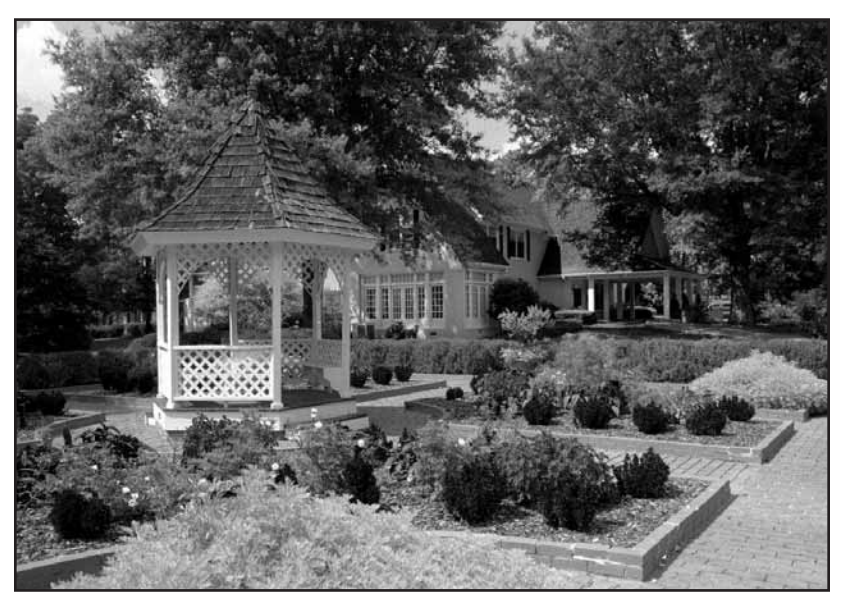
Victory Garden at the Alumni House.