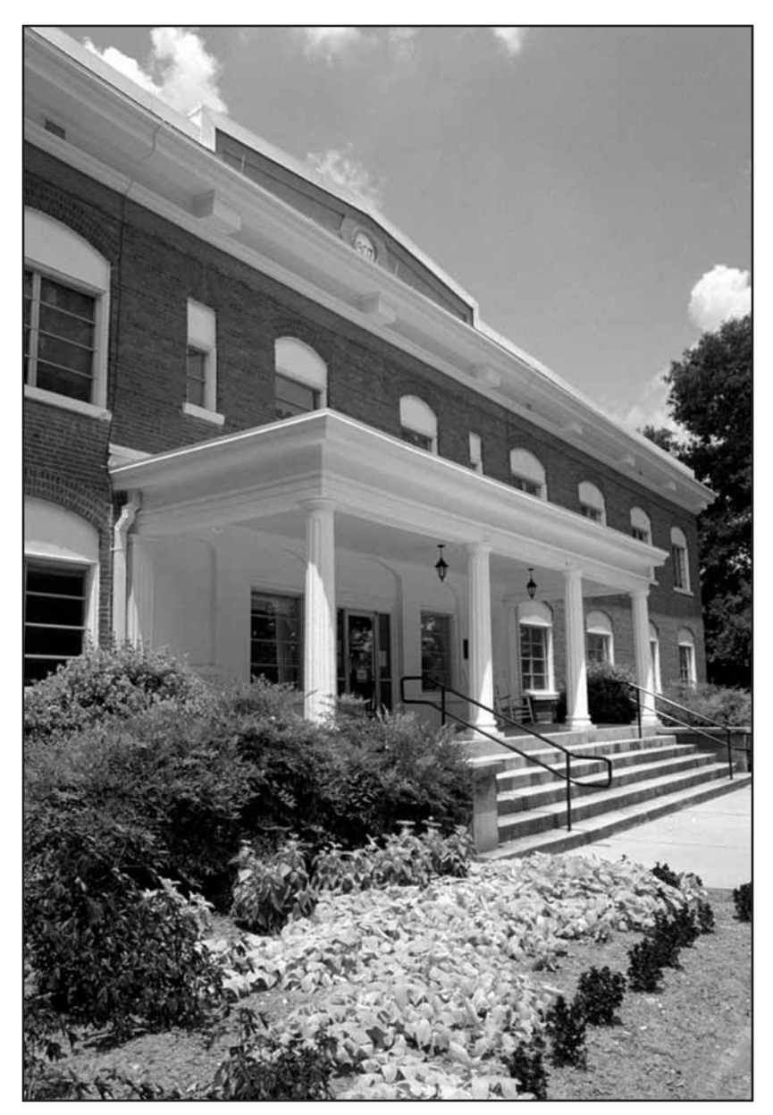
Melson Hall, home of the Department of Psychology and the Debate Team, was built in 1907. It is one of the original buildings of the A&M School plant.