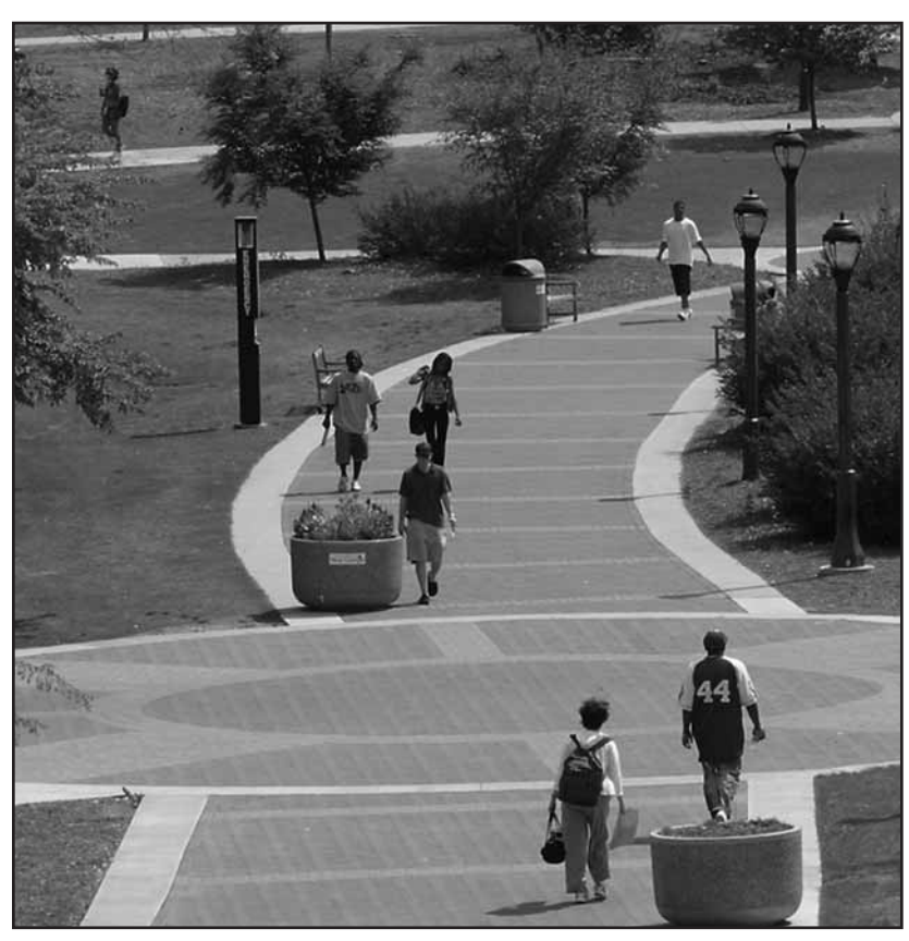
Central campus features an aesthetic view and wide walkways leading to the newest classroom building, the Technology-enhanced Learning Center, Ingram Library, the new Campus Center, and the University Community Center.

EDLE 6312, Principles of Leadership EDLE 6320, Supervision of Instruction CEPD 8141, Clincial Supervision in Counseling