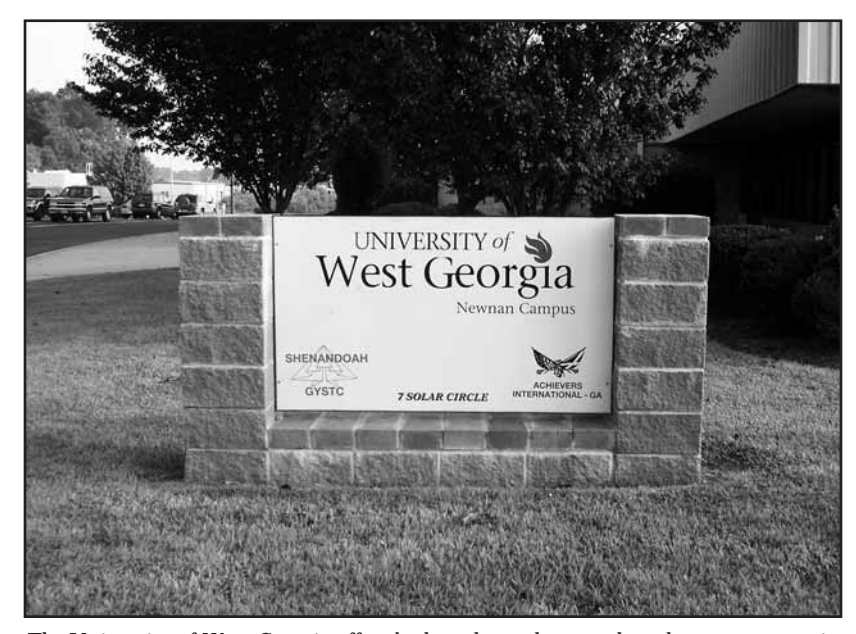
The University of West Georgia offers both undergraduate and graduate courses at its Newnan Center.

The requirements for admission to the Newman Center are the same as admission to the University on its Carrollton campus. Applicants for admission should consult the "Admissions" section in this catalog and the particular requirements of the degree program for which they are applying.